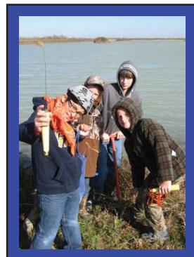
Episcopal Day School December 11, 2011 Coastal Plain Conservancy