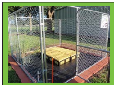
Sts. Leo-Seton School September 14, 2012 Lafayette, LA