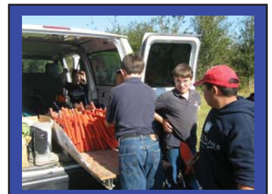
Berchman's Academy November 29, 2012 Avery Island