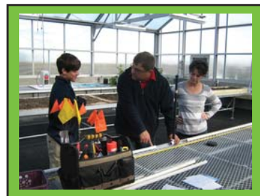
S. Cameron High reinstall! December 20, 2012 Creole, LA