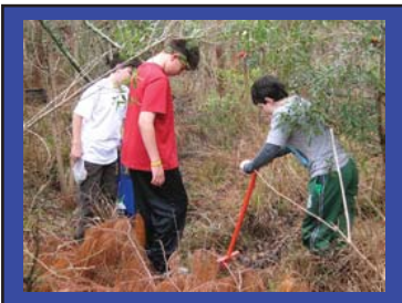
Christ Episcopal December 5, 2012 Fontainebleau State Park