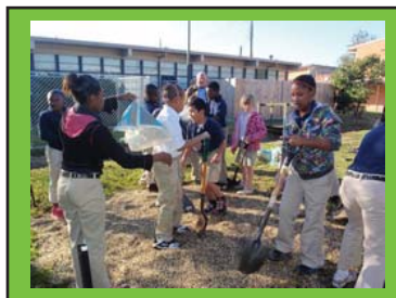
Upper Pointe Coupee Elem November 1, 2012 Batchelor, LA