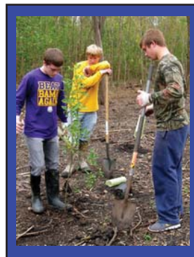
Holy Cross December 7, 2012 Audubon Nature Center