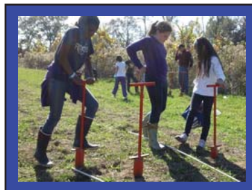
Sacred Heart Academy November 29, 2012 Avery Island