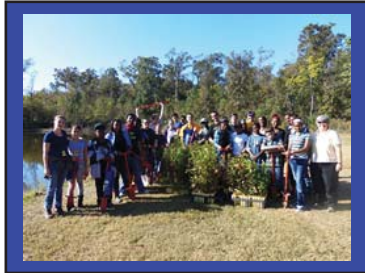
Franklin High November 2, 2012 Palmetto Island State Park