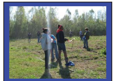
St. Martin's Episcopal December 14, 2012 LDWF Pointe aux Chenes WMA