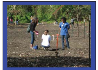
P Taylor Sci & Tech Academy December 6, 2012 New Orleans Couterie Forest, City Park