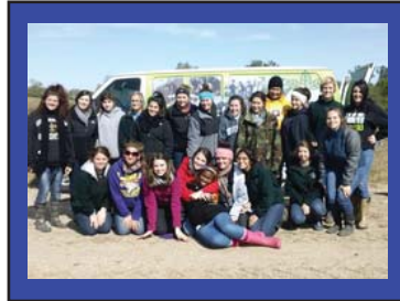
Archbishop Chapelle High November 13, 2012 Bonnet Carré Spillway