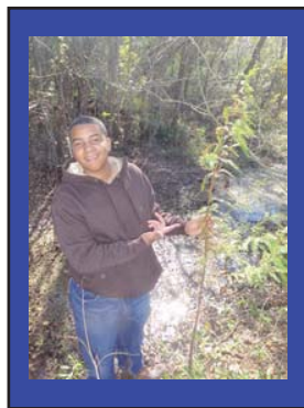
Iberville MSA Academy East November 16, 2012 BREC Comite River Park