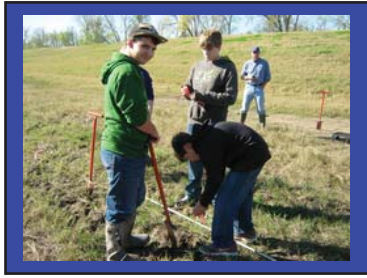
Iberville MSA Academy - West December 19, 2012 Bonnet Carré Spillway