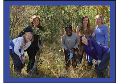
Our Lady of Mercy November 15, 2012 Fontainebleau State Park