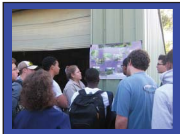
Holy Cross November 30, 2012 Audubon Nature Center